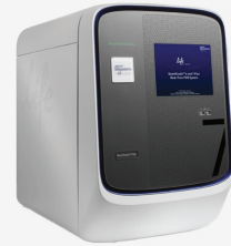
QuantStudio 7 Flex