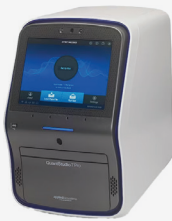
QuantStudio 7 Pro